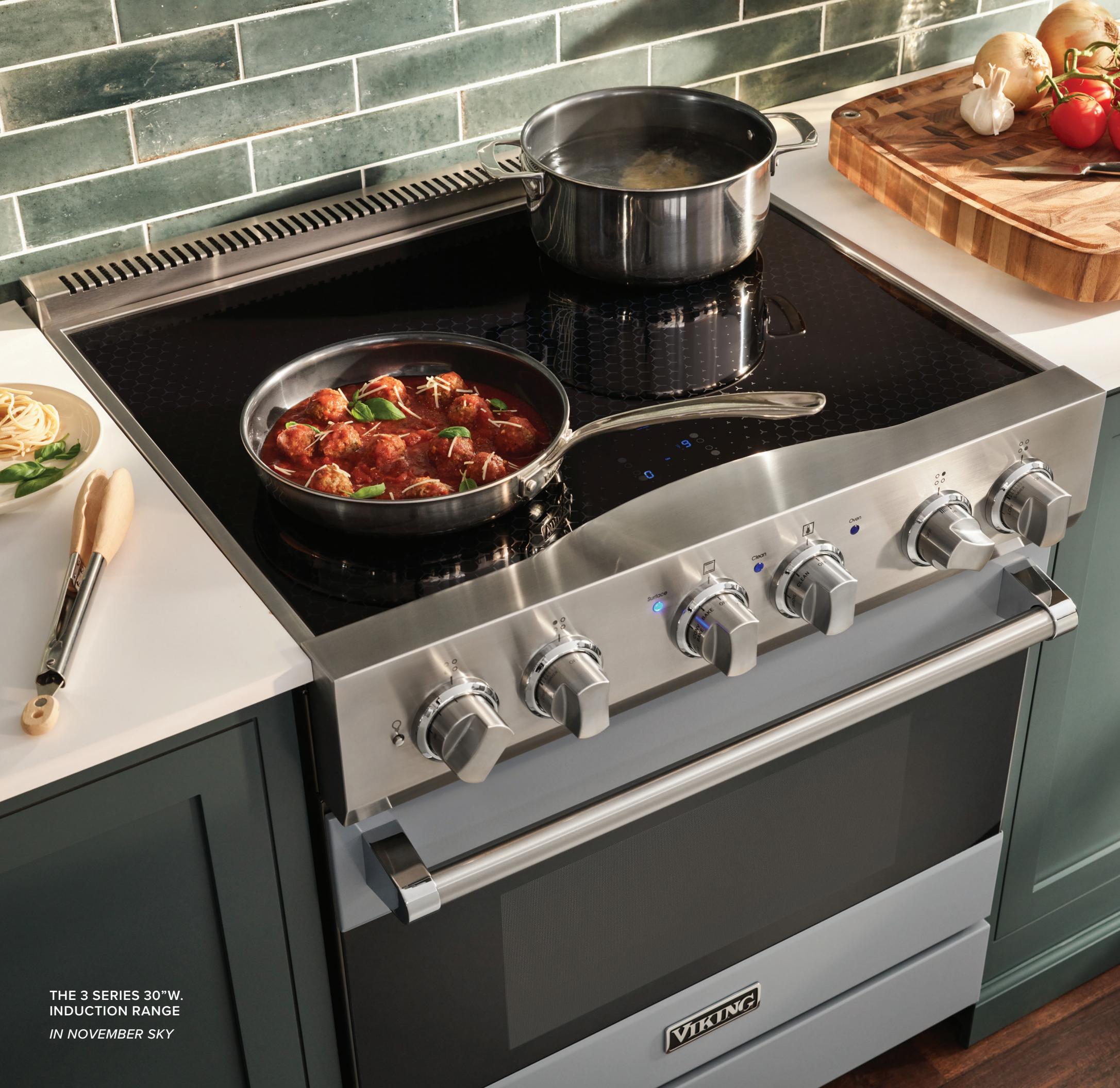
THE 3 SERIES 30"W. INDUCTION RANGE IN NOVEMBER SKY