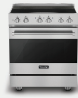
3 SERIES 30"W. RANGE RVIR330 – 4 BURNERS