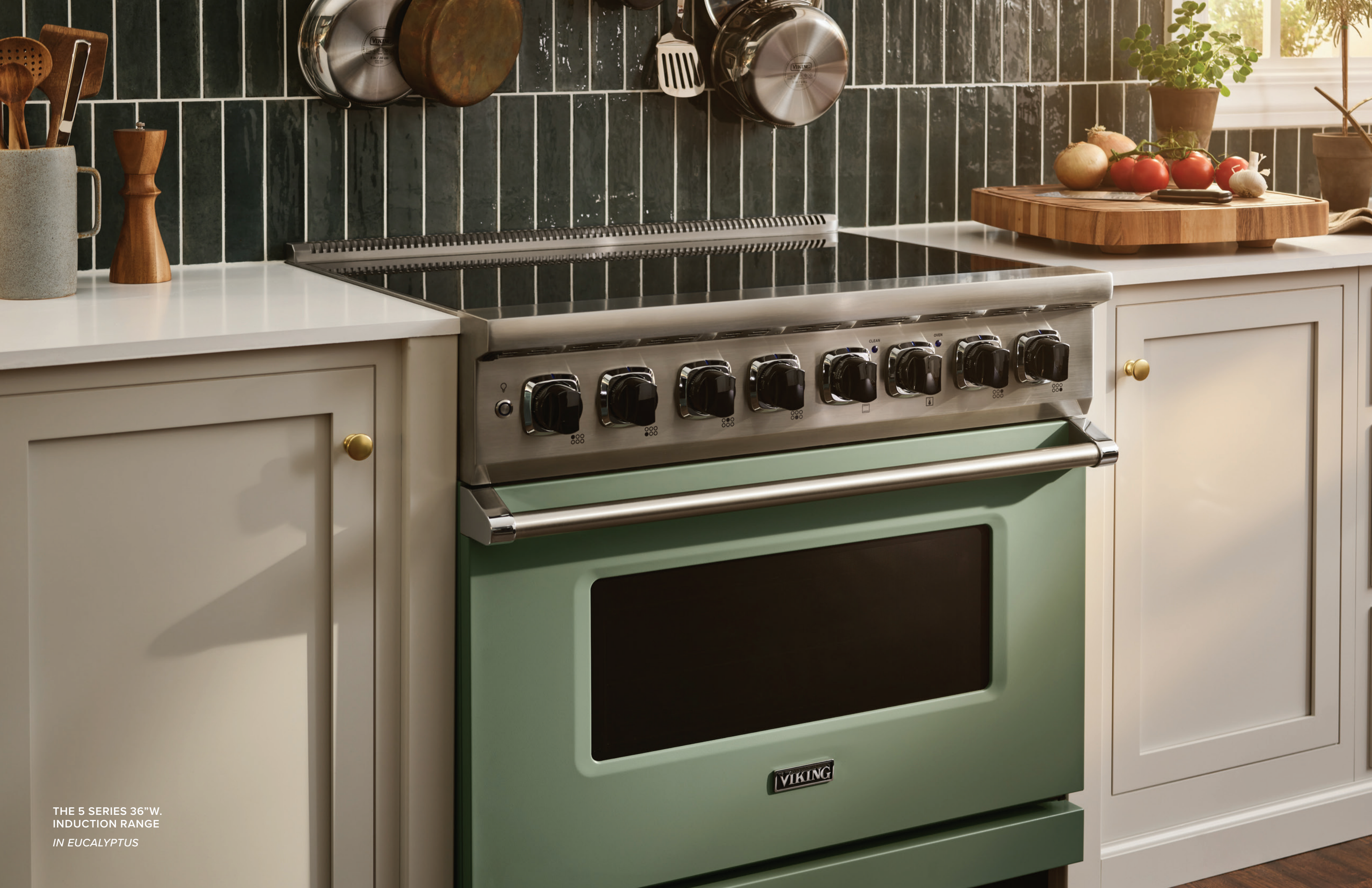
THE 5 SERIES 36" W. INDUCTION RANGE IN EUCALYPTUS