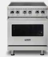
5 SERIES 30"W. RANGE VIR5302 – 4 BURNERS