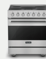
3 SERIES 30"W. RANGE RVER3301 5 BURNERS