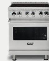
5 SERIES 30"W. RANGE VER5301 4 BURNERS

And with today's advancements, they're more efficient and eco-conscious than ever.