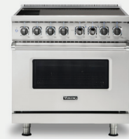
5 SERIES 36"W. RANGE VIR5362 – 6 BURNERS