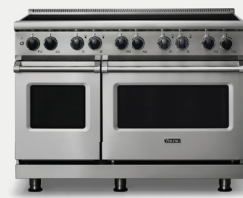
NEW! 5 SERIES 48"W. RANGE VIR5483 – 6 BURNERS